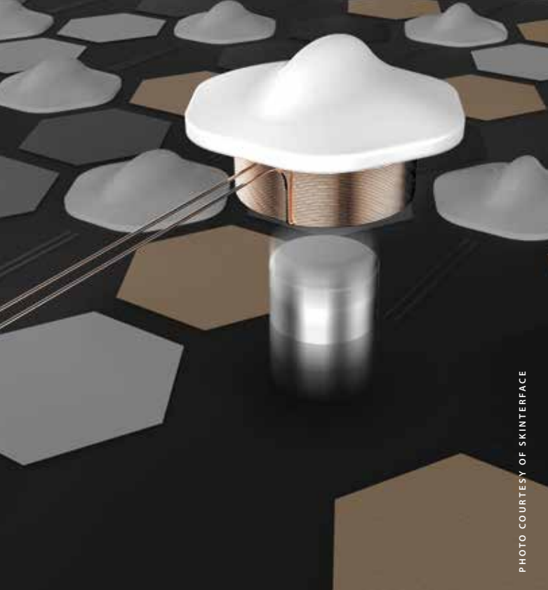
Skinterface rendering of pattern.

At this year's Super Bowl, We:eX debuted the Fan Jersey (USA), a football jersey that uses haptic vibrations