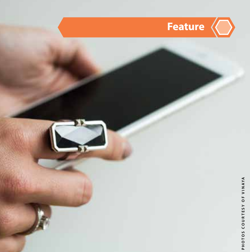
Altruis ring and app.

The launch of their new Aries bracelet collection rounds out the jewelry offering, and a new fitness app makes this bracelet a pretty alternative to a sporty plastic Fitbit.