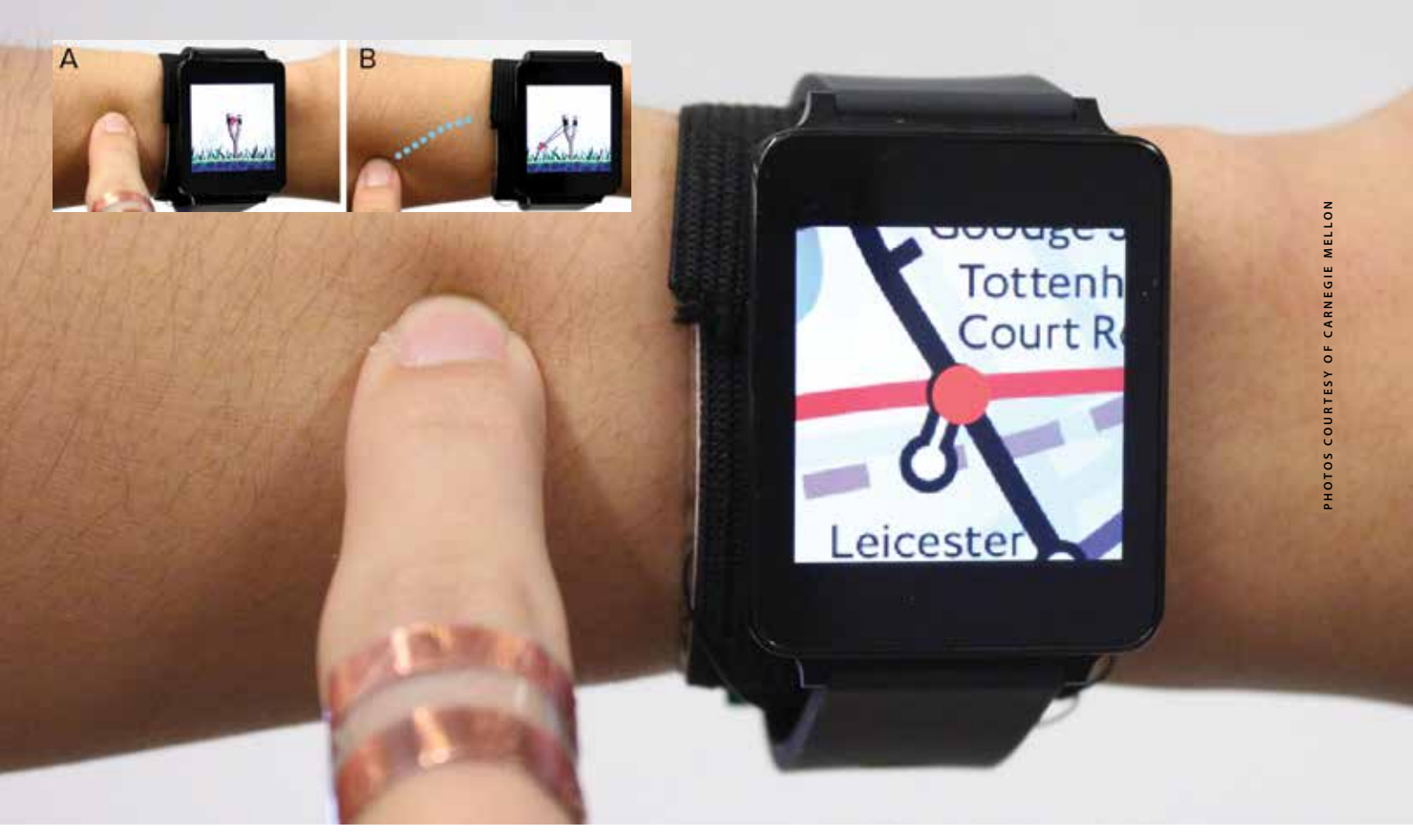
Skin track map apps.

Ralph Lauren offers sportswear that has sensors woven into the garment. Powered by OMSignal, these sensors transmit data to an app that allows you to monitor your athletic prowess.